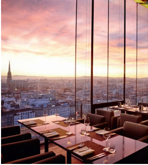
Senior Dialogues, Formal Reception & Aperitif and Dinner at The Loft, SO/ Vienna