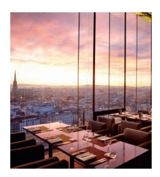
The Loft, SO/ Vienna