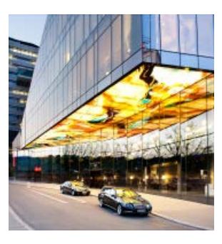
Sofitel Vienna Stephansdom